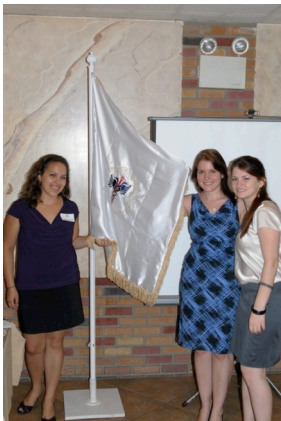
Society new members presenting the AAMS flag

"There are numerous emails that are received from individuals who appreciate the existence of our medical society here in the United States"