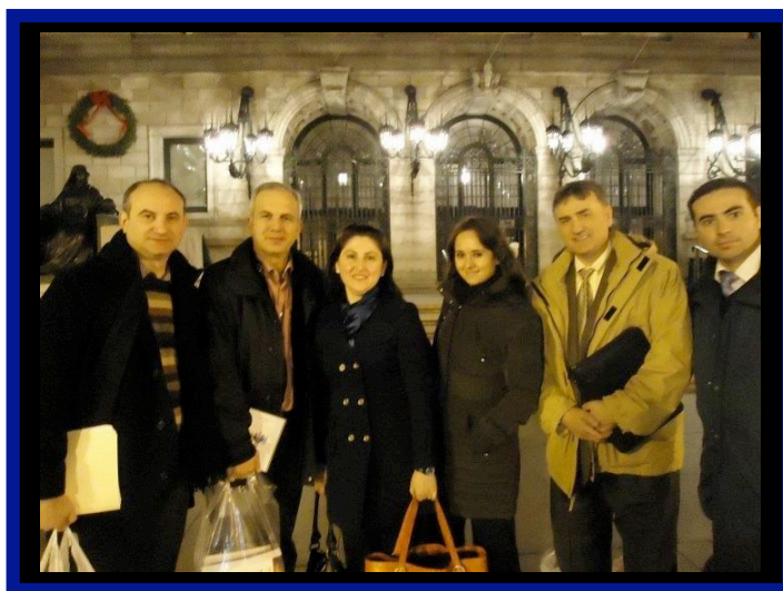
End of Year Meeting, Boston Public Library December 4, 2011

AAMS End of Year Meeting concluded with a sense of continued hard work and dedication from all members, as well as an upcoming year of increased productivity and identification of the needs of the Albanian-American community in the US and abroad.