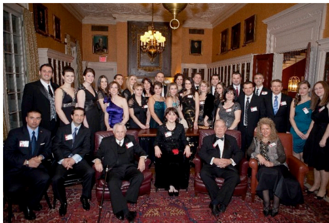
Society Members at the AAMS First Gala Event March 19, 2011 Harvard Club New York, NY